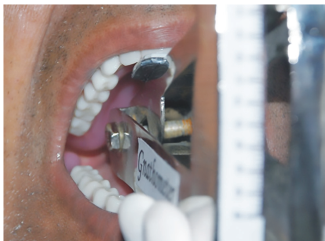
Fig. 2: Recording of BFDD values in patient's mouth using gnomometer

without systemic problems, not under any medication, nonfasting, having class I ridge relationship were randomly selected for the study. All the selected subjects were not satisfied with the retention of their existing complete dentures and have either used denture adhesive once or were unaware of it. Hence, they were explained about the procedure of denture adhesive application, aim of the study, and informed consent was obtained from all the patients. Ethical clearance was obtained from the ethical clearance committee of the institution.