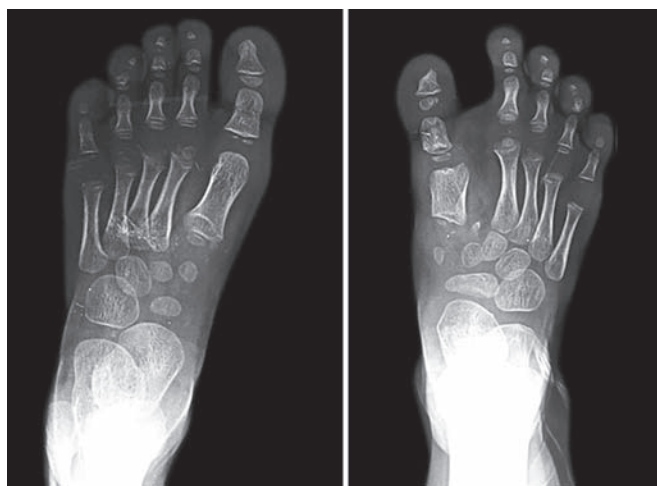
Fig. 5: X-ray of feet at 4 years postoperative follow-up showing a short stumpy first metatarsal and a restored alignment of the first ray of the right foot

presence of accessory tarsal bones differentiates it from polydactyly. 19 However, some have not included it because of its variability. 14 The term preaxial mirror polydactyly has been coined to include feet with supernumerary rays situated medial to the first ray (preaxially) with characteristics of postaxial toes. Preaxial mirror polydactyly (mirror foot) is an extremely rare congenital deformity of the foot. 14 Preaxial mirror polydactyly is distinctly rare with only 30 cases reported in the literature. 18