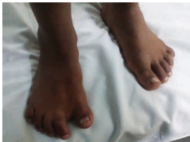
Fig. 4: Clinical photograph at 4 years of age comparing the feet; the right foot showing short first ray and a normal contour of foot

examination, there was no abnormality in the spine, upper limbs, and lower limbs. The hip, knee, ankle, subtalar and metatarso phalangeal joints of the feet were normal and showed no abnormality. However, the child was diagnosed to have a severe sensorineural auditory defect. Radiograph of the foot revealed nine fully developed toes with eight metatarsals (Fig. 2). The metatarsal of the preaxial great toe was additionally bearing the accessory toe. Based on the clinicoradiological examination, a diagnosis of mirror foot was made. The great toe was at an angle of 70° from the long axis of the foot. A wedge resection of the four supernumerary duplicated toes was done. After the excision of the toes, the gap was approximated by bringing the first ray laterally and was fixed by passing the "K" wire (Kirschner's wire) from the tip of distal phalynx of the great toe across the first metatarsal further into the midfoot after realigning the great toe over the first metatarsal and release of the abductor hallucis muscle and the metatarsophalangeal joint capsule on the medial side (Fig. 3).