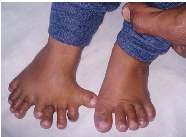
Fig. 1: Photograph at 1 year of age showing preaxial polydactyly with nine toes