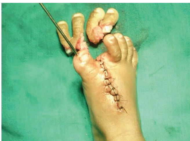
Fig. 3: Intraoperative photograph showing the excised toes and reposition and stabilization of great toe using "K" wire