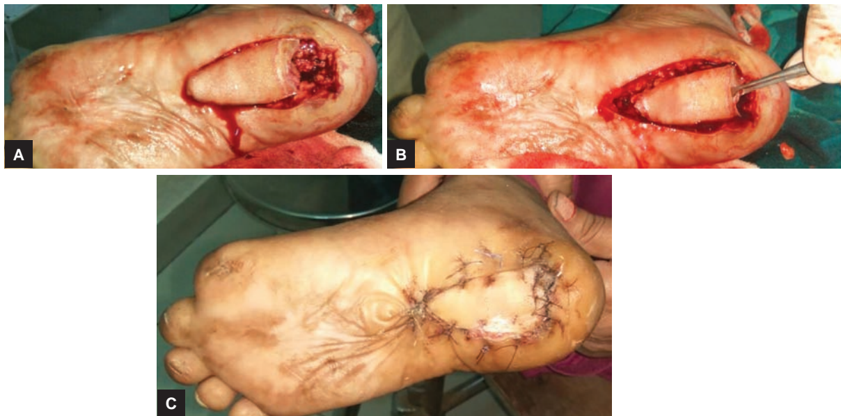
Figs 3A to C: (A) The heel defect after debridement and V-Y advancement flap marking; (B) V-Y advancement flap after inset; (C) well-settled V-Y advancement flap