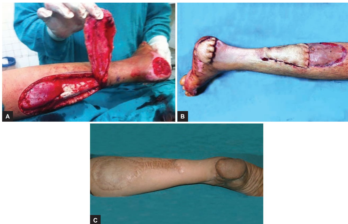
Figs 1A to C: (A) Raised DBSA flap; (B) DBSA flap divided at 3 weeks; and (C) well-settled DBSA flap at 2-years follow-up

posterior aspect of the middle third of the leg (Fig. 1). Since the upper limit of the flap is taken at the junction of upper and middle third of the leg, delay is required, if further extension is needed. This flap is based on the reverse flow in the median superficial sural artery that communicates with the perforators of the peroneal artery distally.