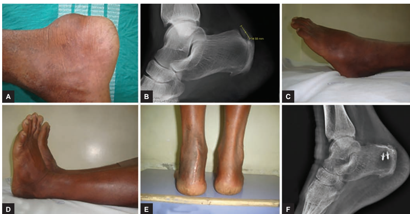
Figs 1A to F: Chronic TA tendinopathy: (A) preoperative clinical photo of dorsal prominence; (B) preoperative X-ray showing Haglund's bump and retrocalcaneal spur; (C–E) movements and clinical photos at final follow-up; and (F) follow-up X-ray showing suture anchor

R: Right; L: Left; SA: Suture anchor; Spur: Retrocalcaneal spur