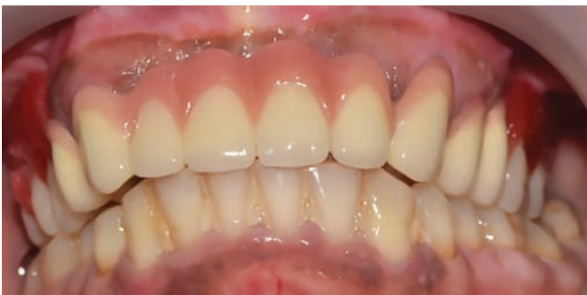
Fig. 10: Anterior FPD and posterior CPD try-in