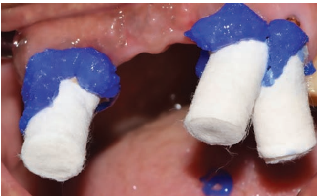
Fig. 3: Gingival retraction using foam cord and compri caps