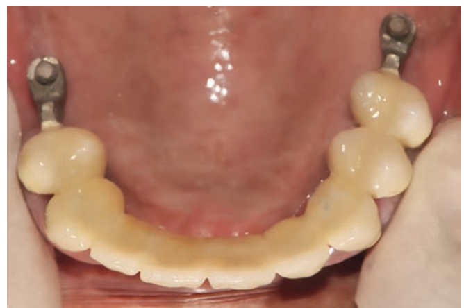
Fig. 6: Bisque try-in

seating of the framework was checked properly followed by proper shade selection for the final porcelain build-up (Fig. 5). Upon bisque try-in of framework, overjet and overbite were visualized and zenith marking intraorally was done using a lead pencil for the replacement of ridge defect using pink porcelain (Figs 6 and 7). Framework pick-up was done using an elastomer impression material (3M ESPE) for the fabrication of CPD framework (Fig. 8). The anterior FPD was cemented after final glazing using glass ionomer cement. The CPD framework try-in was done and the maxilla-mandibular jaw relation for the