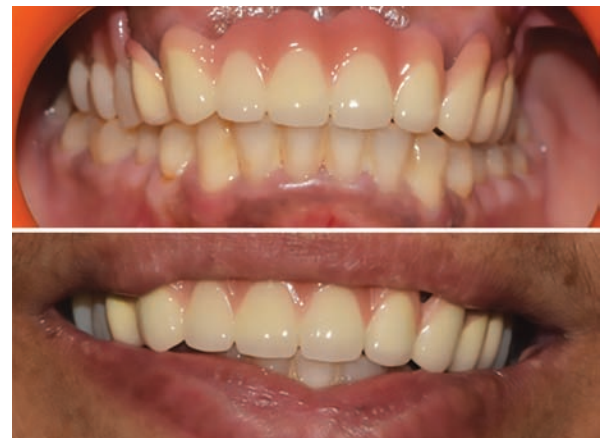
Fig. 11: Cast partial denture insertion

insertion was done with the removal of all interferences present (Fig. 11).