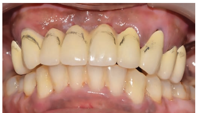
Fig. 7: Gingival zenith marking for gingival porcelain build-up

seating of the framework was checked properly followed by proper shade selection for the final porcelain build-up (Fig. 5). Upon bisque try-in of framework, overjet and overbite were visualized and zenith marking intraorally was done using a lead pencil for the replacement of ridge defect using pink porcelain (Figs 6 and 7). Framework pick-up was done using an elastomer impression material (3M ESPE) for the fabrication of CPD framework (Fig. 8). The anterior FPD was cemented after final glazing using glass ionomer cement. The CPD framework try-in was done and the maxilla-mandibular jaw relation for the