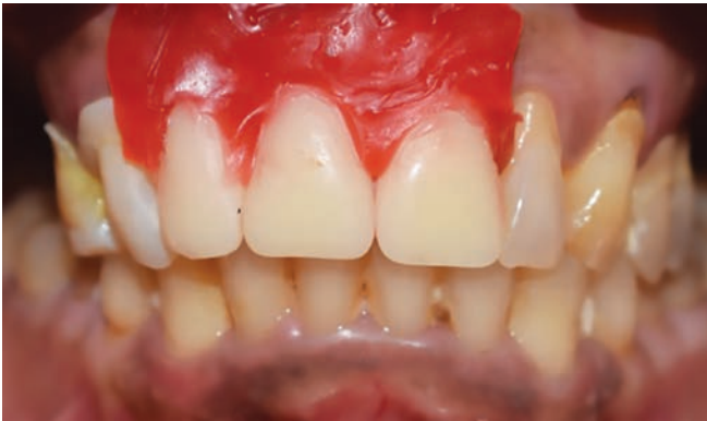
Fig. 1: Wax up trial