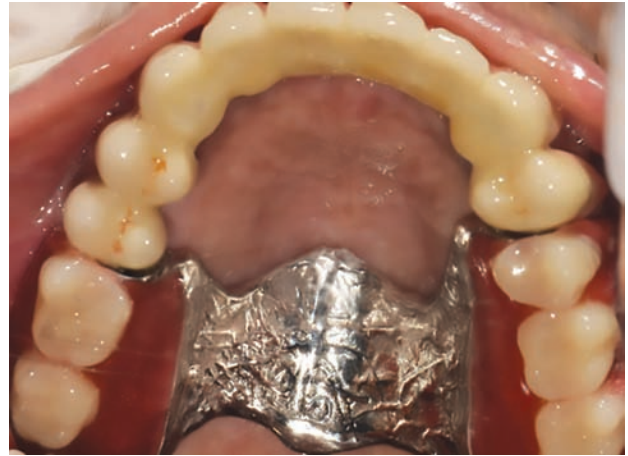
Fig. 9: Cast partial denture try-in