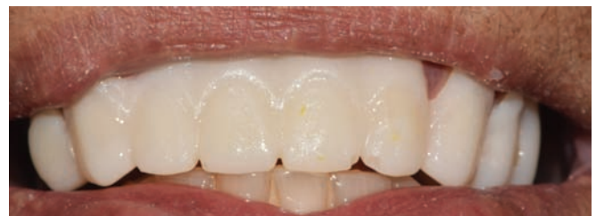
Fig. 4: Provisional bridge