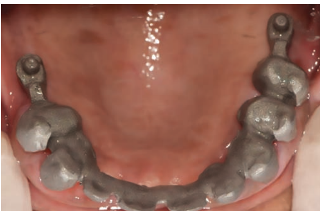
Fig. 5: Metal try-in of framework