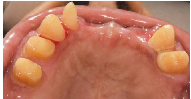
Fig. 2: Mirror image of tooth preparation