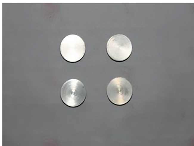
Fig. 2: Titanium disks 5 mm in diameter and 2 mm in width

An MTT assay was conducted to determine cell viability; 12-well plates containing gel applied and non-gel applied disks were seeded with 10,000 cells per cm 2 and F12K (Kaighn's modification of Ham's F-12 medium) medium with 20% fetal calf serum (FCS) and 100 µg/gm streptomycin. During the experiment, the cell media were changed once a week. Nine wells per specimen in total at different time intervals were tested. The MTT solution was added to the cell medium after 24 hours, 7 days, 14 days, and 21 days. The cells were then incubated in the dark for 4 hours at 37°C. The cell medium