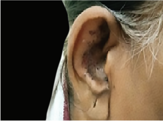
Fig. 1: Crusted vesicles over right pinna