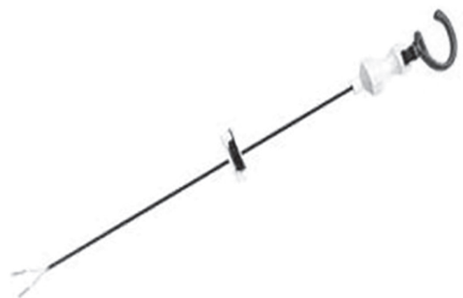
Fig. 2: Mini alligator for two-port LC