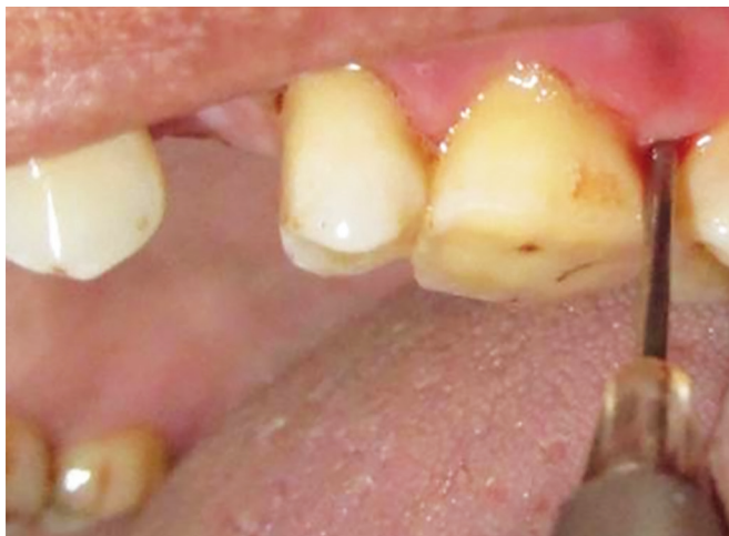
Fig. 1: Lazing

was irrigated with normal saline after each session of irradiation.